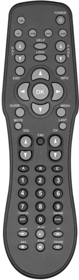
© 2003 US Electronics, LLC. All rights reserved Part Number USE18220, version 2.0 02072003

VISIT US ON THE WEB YOU CAN FIND PROGRAMMING INSTRUCTIONS AND CODES FOR ALL OF OUR REMOTE CONTROLS, AS WELL AS INFORMATION ABOUT OUR OTHER PRODUCTS ON OUR WEBSITE: www.uselectronics.com